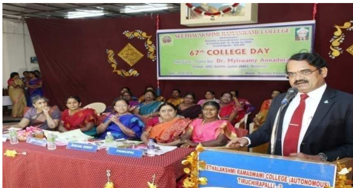
Padma Shri Dr. Mylswamy Annadurai Director ISAC, Bengaluru at 67 th Annual day celebration